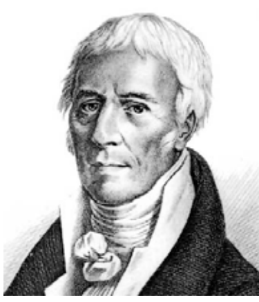
Jean-Baptiste de Monet de Lamarck www.biografiasyvidas.com/biografia/l/lamarck.htm

In differentiation of stem cells into specific cell lines such as liver cells or bone cells, differential gene silencing and activation determines the path the stem cell will take. Our mature cells contain