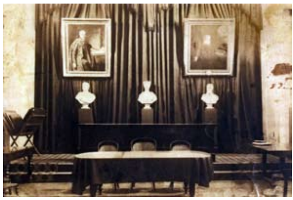
The Science House theatre possibly before the 1950s

t was a pleasure to see Science House, our former [and perhaps future] home, recently used for its original purpose, at least for a few hours. The audience was able