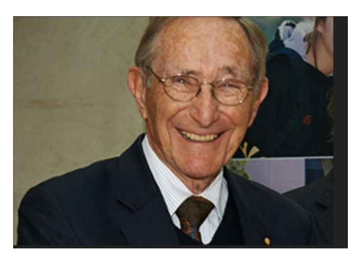
For more information, see page 3

Date : Wednesday, 3 May 2017: 6:30 for 6:45 pm (seating) Venue : Union, University and Schools Club, 25 Bent Street, Sydney