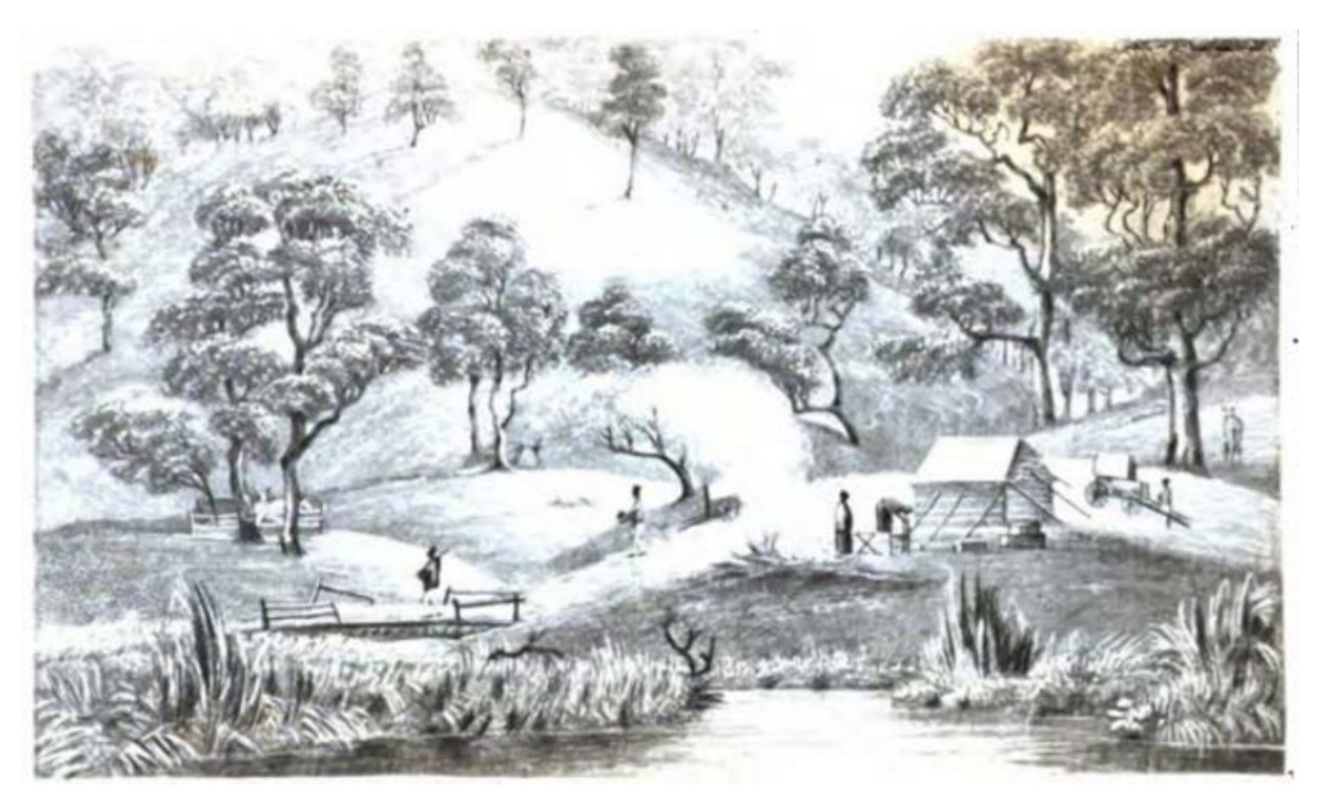
Campbell's River NSW. Frontispiece to Geographical Memoires on NSW . The text of the book can be found at http://gutenberg.net.au/ebooks13/1304421h.html,