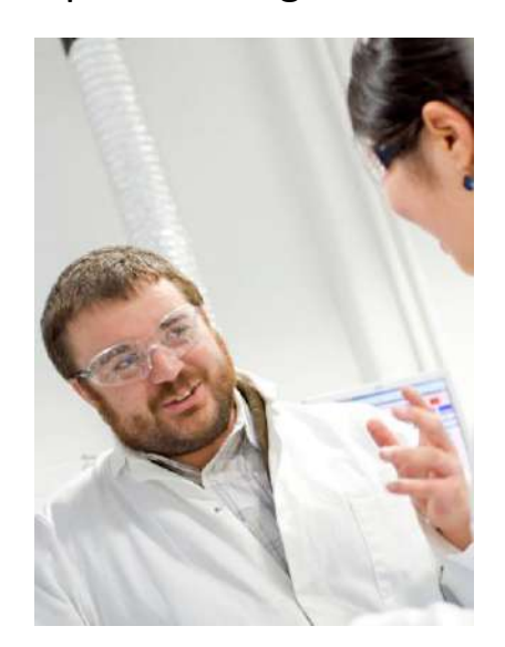
See page 3 for more information

Professor of Clean Energy Imperial College London