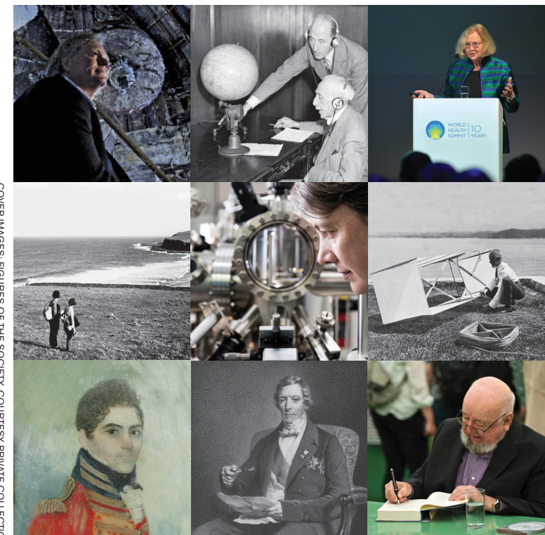
COVER IMAGES: FIGURES OF THE SOCIETY

Enriching lives through knowledge and inquiry