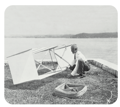
LAWRENCE HARGRAVE WORKING ON A BOX KITE AT POINT PIPER, SYDNEY, ABOUT 1910 (OPPOSITE) MONTAGE FROM THE ORIGINAL GLASS PLATE PHOTOGRAPH FROM HARGRAVE, LAWRENCE. ARRONAUTICS, JOURNAL & PROCEEDINGS OF THE ROYAL SOCIETY OF N.S.W., 32, 1898, 55-85

The Society has broadened its scope in the 21st century, focusing on intellectual inquiry and the promotion of public interdisciplinary discussion across all areas of discovery and knowledge. The Society's Branches, first established in 1961, have expanded to enable it to better serve the whole of the State.