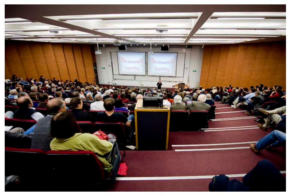
A portion of the large audience for the Pollock Lecture