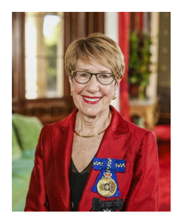
Patron of The Royal Society of NSW Her Excellency The Honourable Margaret Beazley AC KC Governor of New South Wales

RSNSW AND LEARNED ACADEMIES FORUM 2022 Reshaping Australia: Communities in Action 3 November 2022