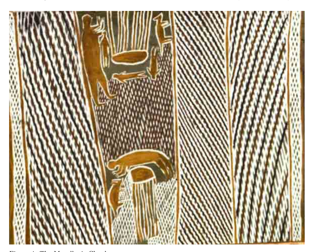
Figure 4. The Magellanic Clouds.

a star of magnitude 0.43 is brighter than a star of magnitude 3.25. The magnitude is a measure of the brightness of a star.]. However, in Yirrkalla the Magellanic Clouds are given a different interpretation. They are interpreted as the homes of an older sister (lower figure), Nujai who lives with her dog in the Large Magellanic Cloud and a younger sister (upper figure), Narai who lives with her dog and children in the Small Magellanic Cloud (Figure 4). The interpretation of these celestial objects is quite different in other Aboriginal communities on the mainland. For example, in central Australia the Magellanic Clouds are looked upon as the homes of the Kungara brothers. The Aborigines believe that the Kungara brothers watch over them from the sky and punish or reward them according to their deeds (Mountford 1976).