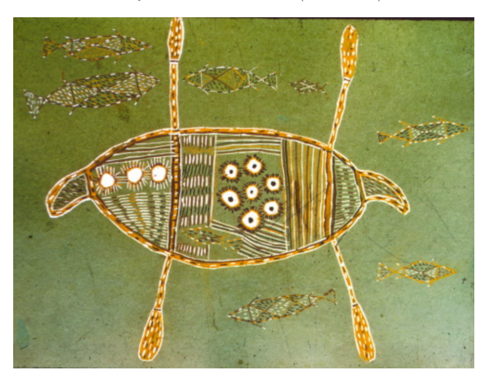
Figure 3. Orion (the three stars on the left) and the Pleiades (the seven stars on the right).

in the Milky Way. It may be the case that the association of the Pleiades with women was transferred to the Aborigines in north Australia by the Macassan fishermen who used to visit north Australia on their fishing expeditions in search of trepang (also known as sea-slug or beche-de-mer). Trepang was prized by the Chinese community in South East Asia for its culinary as well as supposed aphrodisiac properties (Mulvaney and Kamminga 1999). The harmonious relationship which existed between Orion and the Pleiades in north Australia is not repeated in the stories of these celestial objects as seen by the Aborigines in Central Australia. Here the stories are of violence where the men in Orion are constantly chasing the seven sisters. It also needs to be pointed out that the stories about the Pleiades are classified as secret women's business in some parts of Australia and are only known to those who need to know them. The secrecy of these stories has had dire consequences for some Aboriginal groups, such as in the case of the Hindmarsh Island Bridge Affair where a bridge was built between the mainland and the island with absolute disregard for the tradition and culture of the Aboriginal women (Simons 2003).