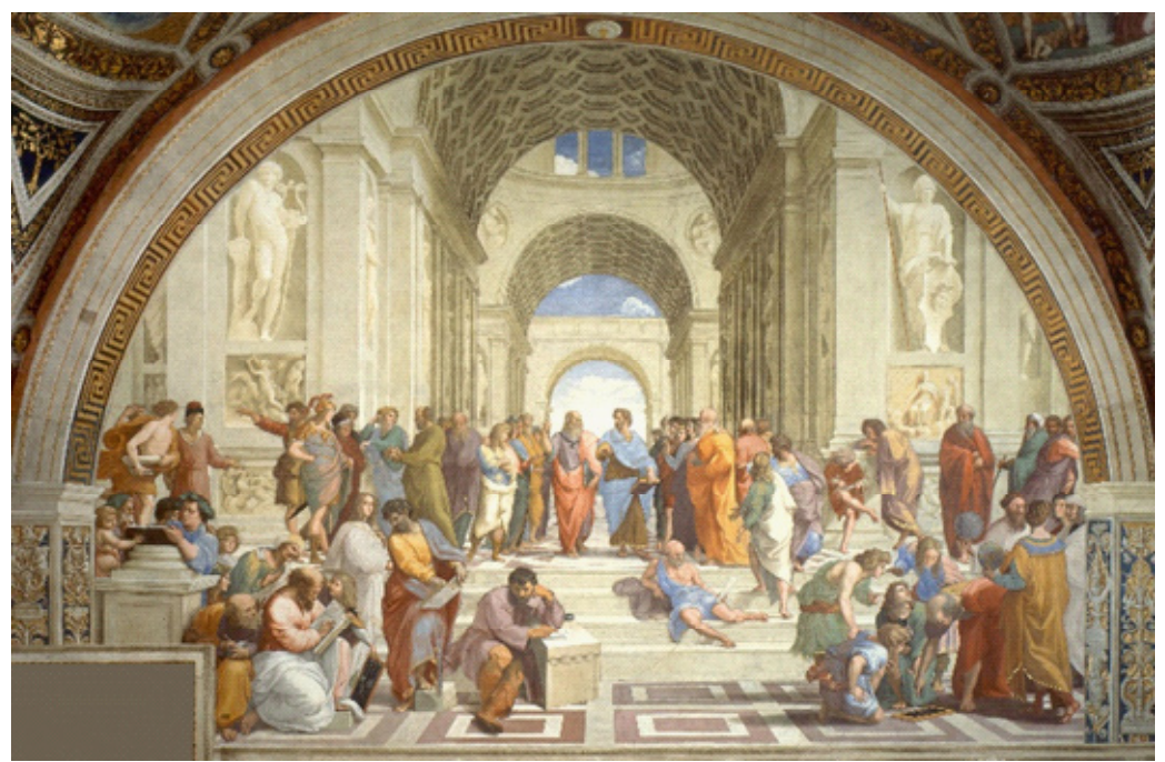
The School of Athens

The way in which we define and attempt to solve problems today has its origins in the philosophy of ancient Greece. Indeed, the rediscovery of classical philosophy in the 13th and 14th centuries was a major influence on the Renaissance. Let me refer to an example. Many of you will have seen this painting or be familiar with it. It was painted by Raphael in 1509 and is a fresco in the Apostolic Palace in the Vatican. It is widely considered as one of the finest pieces of art from the Renaissance. It is usually referred to as The School of Athens (although its formal name is Knowledge of Causes ).