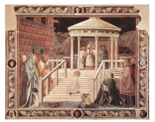
A scene by Paolo Uccello representing Mary approaching a temple.

What I have tried to show here are some of the foundational influences on the Western way of thought, as represented through its art. Whether or not Feyerabend's theory is correct is open to discussion but it is hard to accept as coincidental the extraordinary development in the sophistication of artistic representation that happened at the same time as the development of philosophical thought in centres such as Florence and Padua. As the influence of the Renaissance moved from Italy across Europe, the centre of intellectual thought gravitated towards Holland, to (what is now) Germany and to England. The discoveries and thinking of Copernicus, Galileo, Bacon, Locke and Newton, based on Greek philosophy, continued to develop within the mechanistic Greek paradigm-the universe was like a great machine overseen by God. This thinking prevailed until the 18th century when philosophers such as Kant and Hegel brought different perspectives to our interpretation of reality and the "interconnectedness" of everything in the universe. Nonetheless, the mechanistic paradigm persisted until the late 19th century. At about this time, biology and ecology began to develop and the mechanistic paradigm was insufficient to