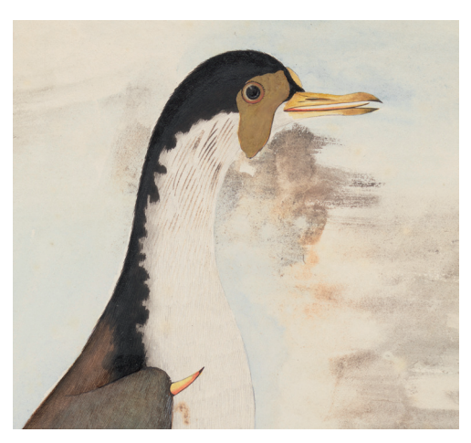
9: Detail of Masked lapwing or Spur winged plover ( Vanellus miles ), 1790s/artist unknown. Watercolour (Derby Collection ML PXD 1098, vol. 4 FL345345. Mitchell Library, State Library of NSW)

has discoloured to black over time, revealing the alteration quite clearly to the naked eye (Illus. 8, 9).