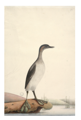
16: Little Grebe ( Podiceps ruficollis), 1790s/ Sydney Bird Painter. Watercolour.

ing colour with a brush (Illus. 15). Blending can be seen in the work of more skilled artists such as the Sydney Bird Painter, suggesting the possibility that this talented but unidentified artist was not a naval artist (Illus. 16).