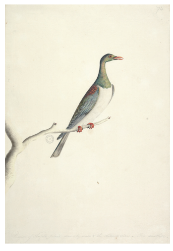
17: Norfolk Island Pigeon ( Hemiphaga novæseelandiæ spadicea ), 1790s/Sydney Bird Painter. Watercolour with gold leaf on head and throat (ML PXD 226 f. 84 FL8966160 Mitchell Library, State Library of NSW) [now extinct — Ed.]

The Sydney Bird Painter's drawings are in a volume of a hundred drawings that came into the collection of the State Library of NSW in 1902. Its provenance is completely unrecorded and for the last three decades it has been believed to have been drawn in