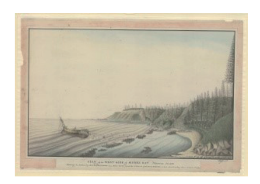
6: "The Melancholy Loss of His Majesty's Ship Sirius, Wreck'd on Norfolk Island, on Friday Noon March 19th 1790,"/George Raper. Watercolour (Raper Collection, drawing no. 23. Natural History Museum, London)

Stripped bare of the desperation of the wrecking, the people and the desperate activity — everything that made the original drawings genuine and dramatic — the copy