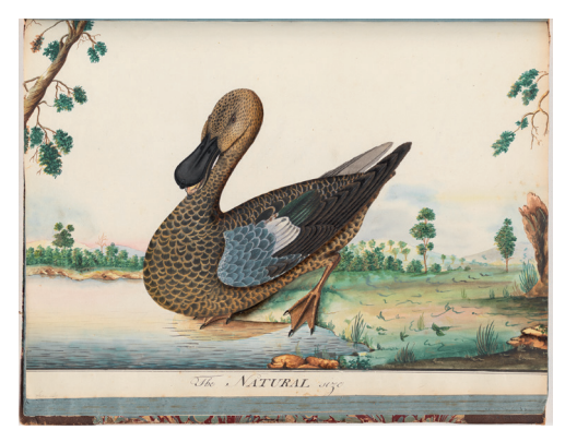
19: Hawkesbury duck or Australasian shoveler ( Anas rhynchotis), 1790s?/artist unknown. Watercolour

grass."<sup>3</sup> John Hunter described "the Woods here ... resemble Deer parks, as much as if they were intended for that purpose,"<sup>4</sup> and Arthur Phillip noted that the grass is "as fine as in any Park in England."<sup>5</sup>