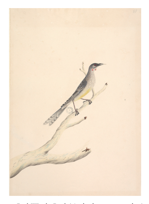
10: Red Wattle-Bird ( Anthochæra carunculata), 1790s/Sydney Bird Painter. Watercolour