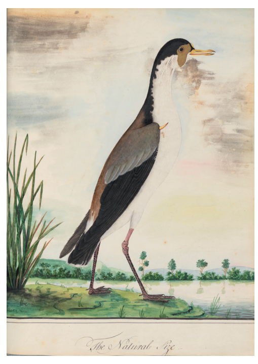
8: Masked lapwing or Spur winged plover ( Vanellus miles ), 1790s/artist unknown. Watercolour (Derby Collection ML PXD 1098, vol. 4 FL345345. Mitchell Library, State Library of NSW)