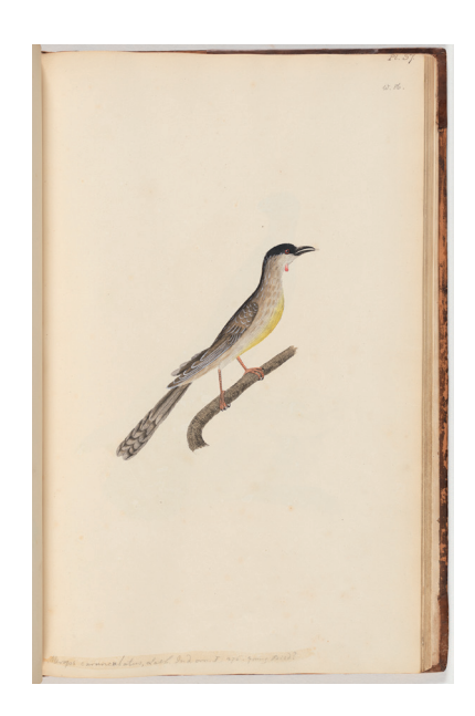
12: "Wattled Bee-eater," ca 1797/artist unknown. Watercolour (Derby Collection ML SAFE PXD 1098 vol. 1 f. 37 FL357938 Mitchell Library, State Library of NSW)

This copying also suggests that artists were working together or in reference to each other, and, more than that, suggests the possibility that they were sharing drawings, and copying each other's work in little de facto drawing schools.