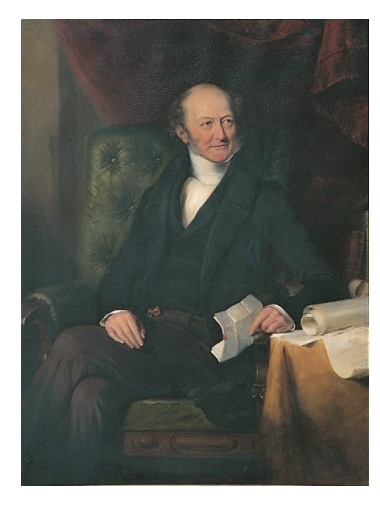
3: Edward Smith-Stanley, 13th Earl of Derby, 1837/William Derby. Oil on canvas. Courtesy The Rt Hon. The Earl of Derby

The collection consists of 745 natural history drawings bound into six volumes. Half had not been seen since at least the 1940s; the existence of the other half was completely unrecorded.