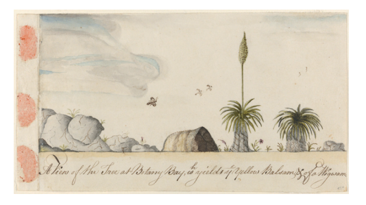
1: Grass tree or "A View of the Tree at Botany Bay, wh yields ye Yellow Balsam, & of a Wigwan," 1788/Arthur Bowes Smyth. Watercolour (Mitchell Library ML Safe 1/15 no. 6 FL1607156)

held at Knowsley Hall near Liverpool, England, and owned by the 19th Earl of Derby. The drawings had been compiled during the 1790s by a now forgotten but then widely known and acclaimed botanist, Aylmer Bourke Lambert. They were acquired for the collection of the State Library of NSW in 2011.