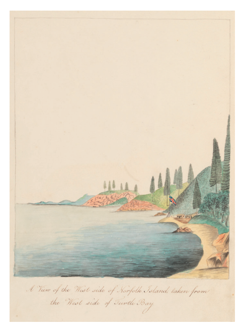
5: "A View of the West side of Norfolk Island taken from the west side of Turtle Bay," ca 1797/artist unknown. Watercolour