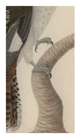
15: Detail of Illus. 2 above