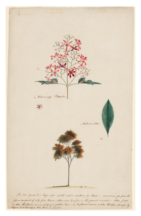
13: Christmas Bush ( Ceratopetalum gummiferum ), 1788–1794/artist unknown Watercolour (DGD 38 f. 1 FL1000688 Dixson Galleries, State Library of NSW)

Surgeons, such as Arthur Bowes Smyth, were often amateur artists with an interest in recording the medicinal properties of plants, and drawing was also part of a suite of compulsory skills required for progression though the ranks of the Royal Navy, needed to record the coastal profiles and features of places passed, named or claimed.