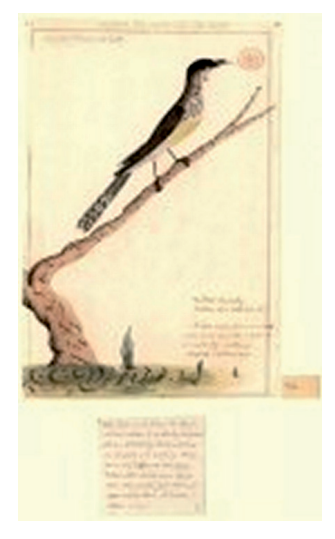
11: "Wattled Bee-eater" (Anthochæra carunculata), 1788–1793/Port Jackson Painter. Watercolour (Watling Collection, Natural History Museum, London Watling drawing — no. 166)