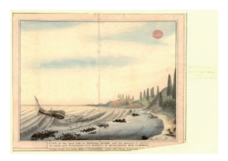
7: "A View of the West side of Norfolk Island and the manner in which the crew and provisions were saved out of His Majesty's Ship the Sirius, taken from the West side of Turtle Bay after she was wreck'd," ca 1790/Port Jackson Painter. Watercolour (Watling Collection drawing no. 22. Natural History Museum, London)

Stripped bare of the desperation of the wrecking, the people and the desperate activity — everything that made the original drawings genuine and dramatic — the copy