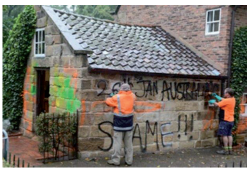
Fig. 2: Cleansing the graffiti from Cooks' Cottage, Melbourne, The Age , 24 January 2020.

In the year 2020, the Australian Government's decision to celebrate the 250th anniversary of Captain James Cook's arrival in Australia has become a subject of bitter controversy. Some Australians, particularly those of Indigenous heritage, see the event as an occasion of mourning rather than as a reason to celebrate Cook's achievements. A few have taken their protests to the extent of vandalising statues of Cook by spraying them with paint and daubing them with slogans. It is not the intent of the present article to express an opinion on this matter, other than to comment on the sad irony of the fact that the vandalising of Cooks' Cottage in Melbourne and its daubing with the word "Shame" (see Figure 2) appears to have been somewhat misplaced, given that Captain James Cook never lived in the cottage and that he set foot in it, at most, on only two possible occasions. What remains valid, however, is the testimony offered by this story of encouragement of local talent wherever found, to the power of education and science: these at their best are what extend our understanding of human culture and the natural world.