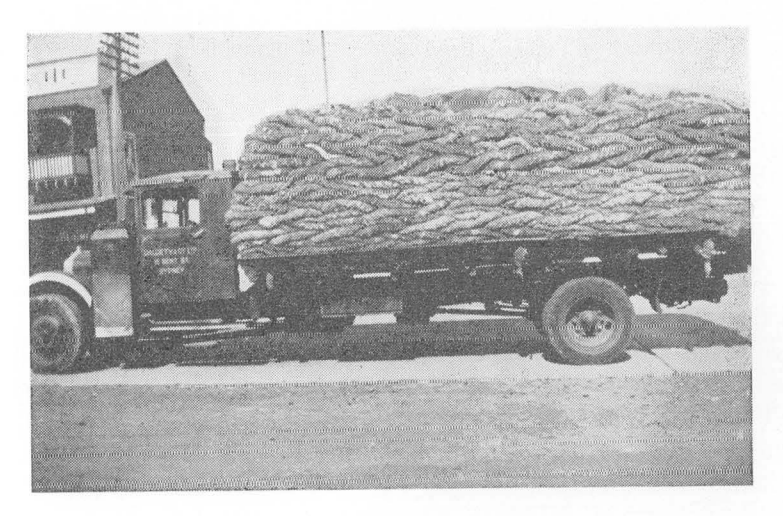
This photograph shows a gas producer unit fitted to a truck operated during the Second World War.

and vehicles were fitted with gas bags to carry their own supply of gas. Others had charcoal burners and many other novel methods of producing power, none of course being as effective as the normal petrol fuel. As the trucks were imported, supplies of spare parts became hard to obtain and new vehicles impossible — in fact, many second-hand vehicles were taken by the government for military purposes. A further problem was the loss of many experienced men who followed the call and joined the armed forces. At this time, work became very brisk and hectic because of the tremendous amount of equipment and supplies needed by the forces, both Australian and U.S.