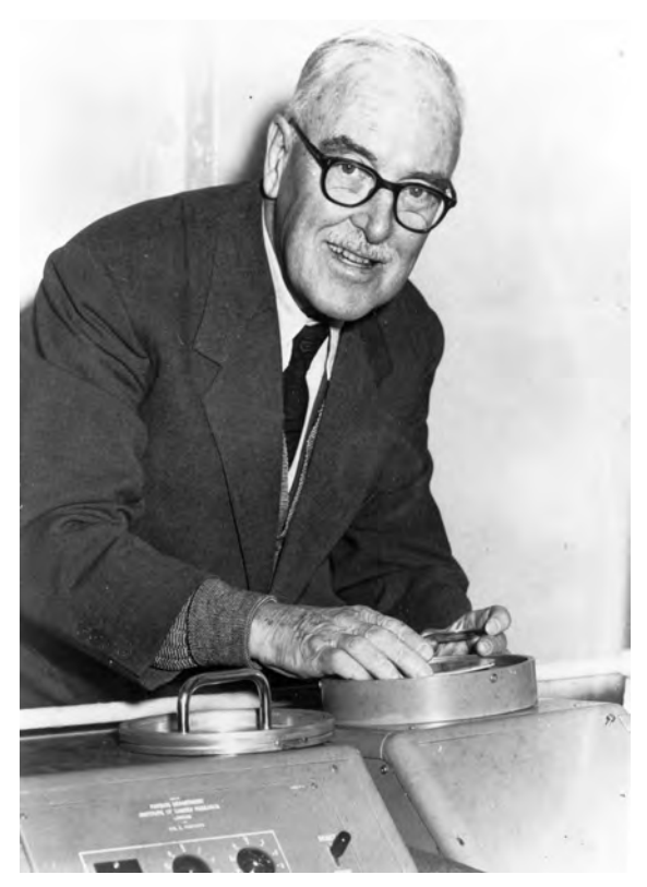
Fig 3. Sir Ernest Marsden in June 1961, on board the Sydney Star at Bluff, New Zealand, testing the radioactivity of a sample of seawater.

radioactive fallout from nuclear bomb tests, and the potential biological effects of environmental radiation, and in so doing helped to encourage the country on a path to what we now call a 'nuclear free' New Zealand.