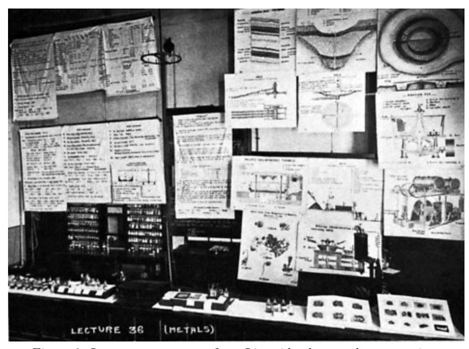
Figure 2. Lecture room set up for a Liversidge lecture-demonstration.

Outside the laboratory and classroom, Liversidge's early fascination with collecting natural and man-made objects gave him a commanding position in the 'exhibition movement' of his day. His efforts helped 'sell' New South Wales to the world at large – beginning with the Paris Exhibition of 1878, and continuing with the Sydney International Exhibition (the 'Garden Palace') in 1879 – from which grew the Industrial, Technological and Sanitary Museum, later the Museum of Applied Arts and Sciences, which we know today as the Powerhouse in Ultimo. His influence on the making of key scientific appointments - notably, at the Technical College and at the Botanic Gardens, became the stuff of legend (MacLeod, 2005b). Building an extensive correspondence, he encouraged intercolonial ties, especially with Victoria and South Australia, and encouraged scientific exchanges across the Tasman.