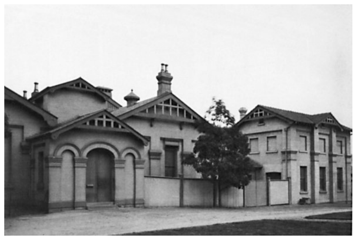
Figure 4. Chemistry Building (now Pharmacy School).

of New South Wales and the Chemistry (now Pharmacy) building at Sydney University (Fig. 4), his name is missing. There is no structure named for him in Sydney, although the planners of Australia's capital, with greater sympathy, named a street after him, appropriately next to the Australian National University and the Australian Academy of Science.