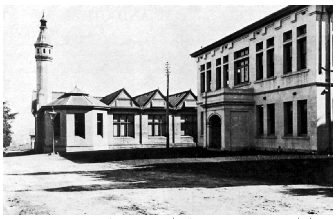
Figure 3. School of Mines/Geology building (right), former Engineering Building (left).