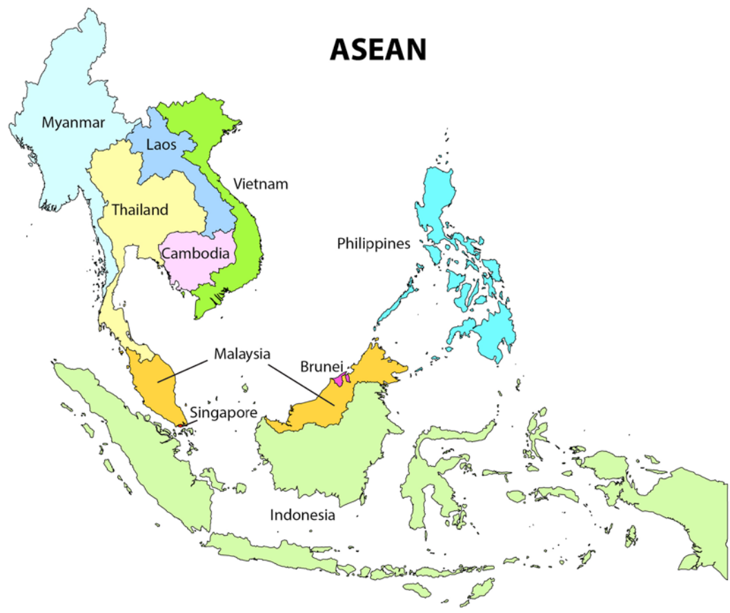
Figure 2: ASEAN states.

In Singapore, foreign workers recruited for low-skilled occupations are classified as temporary workers and are employed in designated sectors for specific periods. They are hired under the Work Permit (R Pass) program, which is restrictive and designed to prevent settlement of the workers. There is also an S Pass category meant for mid-level skilled workers who have a trade qualification and relevant work experience. Employers in Singapore are required to pay a monthly levy on foreign workers employed in their firms/companies under both the Work Permit or S pass categories. Additionally,